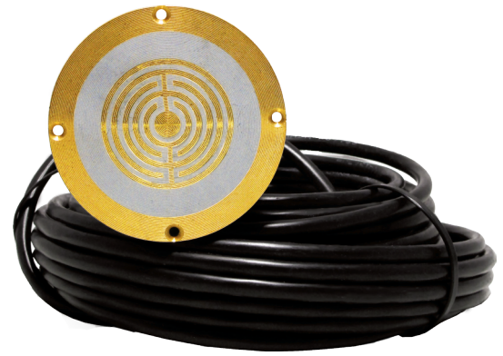
Snow/Ice Sensor 090

The Snow/Ice Sensor 090 is an in ground sensor used with Watts Radiant snow melting controls 653 and 654, and some tekmar snow melting controls to automatically detect snow or ice on a driveway or walkway. The snow/ice sensor has 65 ft (20 m) of wire. This product can be used in applications ranging from residential driveways to commercial building fronts such as emergency access entries. This sensor allows the above snow melting controls to automatically operate the snow/ice melt system only when snow or ice is present, while also providing slab temperature feedback to the control.