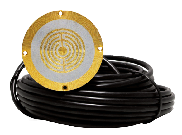
Snow/Ice Sensor 090

The Snow / Ice Sensor 090 must be operated by a Watts Radiant Snow Melting Control 653 or 654, or a compatible tekmar Snow Melting Control.